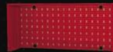
KRW7554A Riser with Door Pre-assembled at Factory