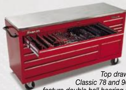
Top drawers on the Classic 78 and 96 roll cabs feature double ball bearing slides and four support stiffeners for 250 lb. capacity.

Our drawers make your job easier, with the largest variety of sizes and larger pulls for more finger space. Position your drawers any way you want, with 2 inch mounting centers on the whole box and quick disconnect slides. You can add more drawers anywhere on the roll cab or top chest. You can't do that with most competitive boxes. These drawers feature aluminum drawer trim — not plastic like many other brands.