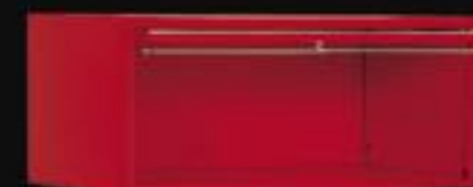
KRWL3635 Bulk Storage Top