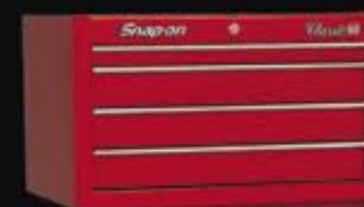
KRA2404 Top Chest