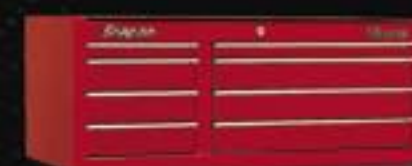
KRA2408 Top Chest