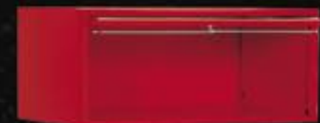
KRWL3635 Bulk Storage Top (2 required)