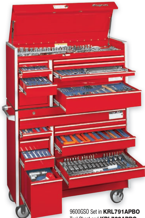
9600GSO Set in KRL791APBO Tool Chest and KRL722APBO Roll Cab (U.S. Set 6)