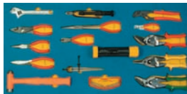
4000 Series Maintenance Add-On Set

Contact your Snap-on Account Manager to choose your Roll Cab and to add a custom foam insert.