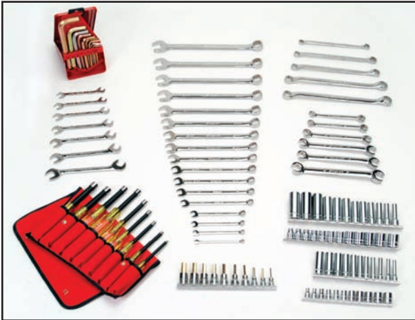
4000 Series Metric Add-On 4102GM1