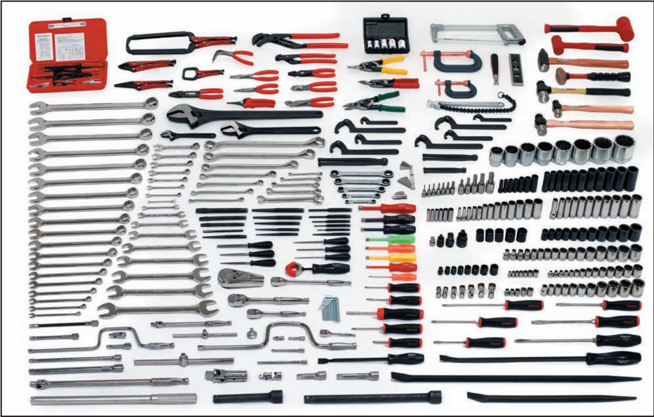
4338GS Master Maintenance Service Kit