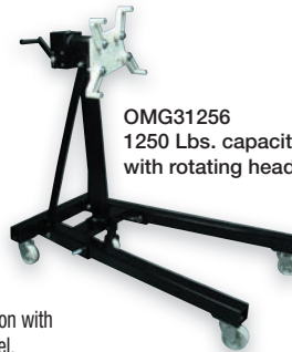
OMG31256 1250 Lbs. capacity with rotating head