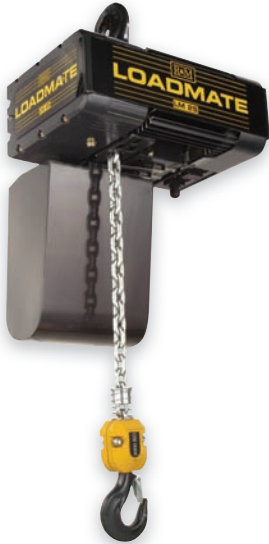
Fixed Top Hook