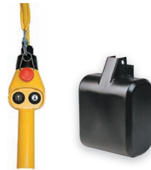
P/B Station with E-stop and Chain Container are Standard

Contact your local area Snap-on representative