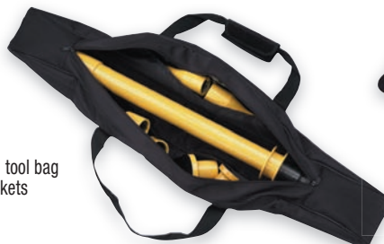
SHD25120 38" Heavy nylon tool bag with interior pockets

Biggest maximum force (BMF) for toughest application