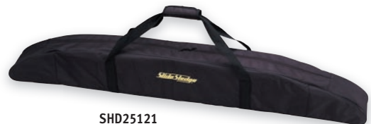
SHD25121 52" Heavy nylon tool bag with interior pockets