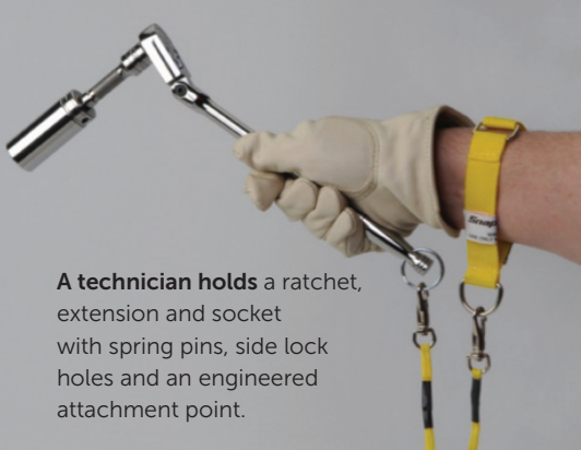
A technician holds a ratchet, extension and socket with spring pins, side lock holes and an engineered attachment point.

Solution: Use square drive tool systems with locking spring pins, side lock holes, and engineered attachment points.