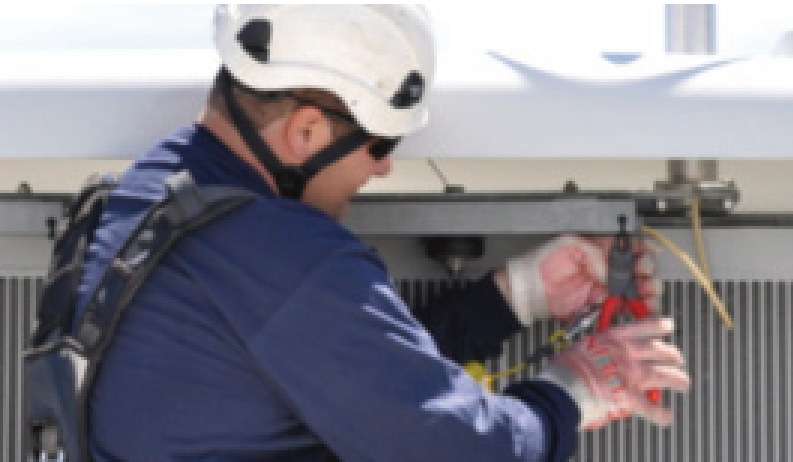
A wind technician uses a tethered cutting plier with an engineered attachment point located away from the gripping surfaces.

overnight. Implementing a tool-drop prevention program is a significant paradigm shift, challenged by a lack of awareness, resistance to change and a drive toward increased productivity.