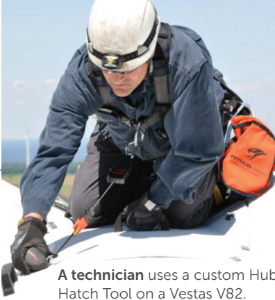
A technician uses a custom Hub Hatch Tool on a Vestas V82.