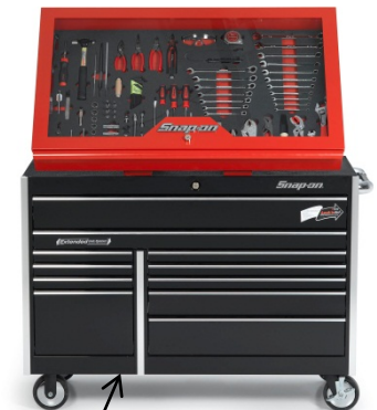
KRA2422PC Roll Cab