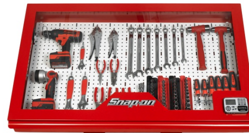
VCC 5S Box with Peg Board Tool Control