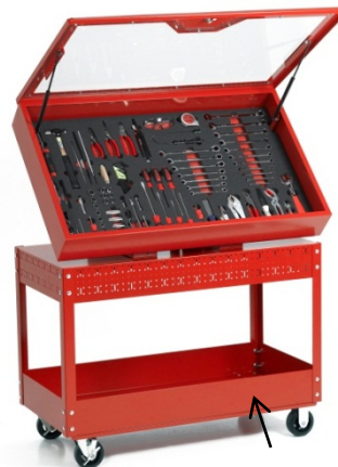
L5V5SCRTPBO Optional Cart