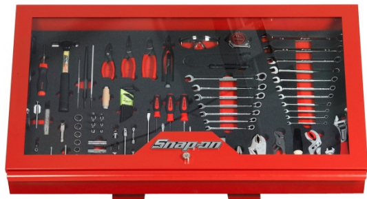
VCC 5S Box with V-stand mounting brackets, and Foam Tool Control see page 4/5 for part #'s and details