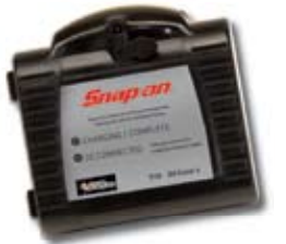
Lithium Ion Battery BK6000-1