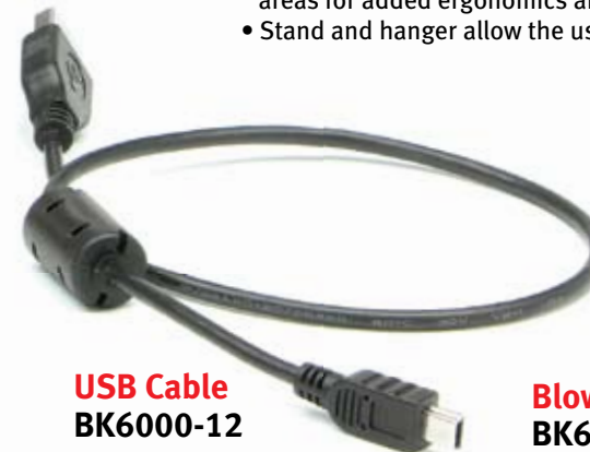
USB Cable BK6000-12