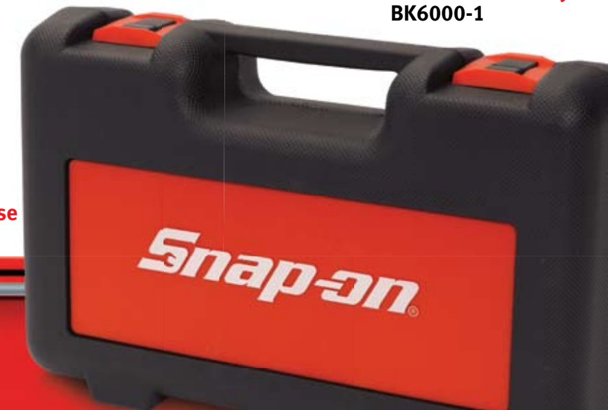
Blow Molded Case BK6000-6