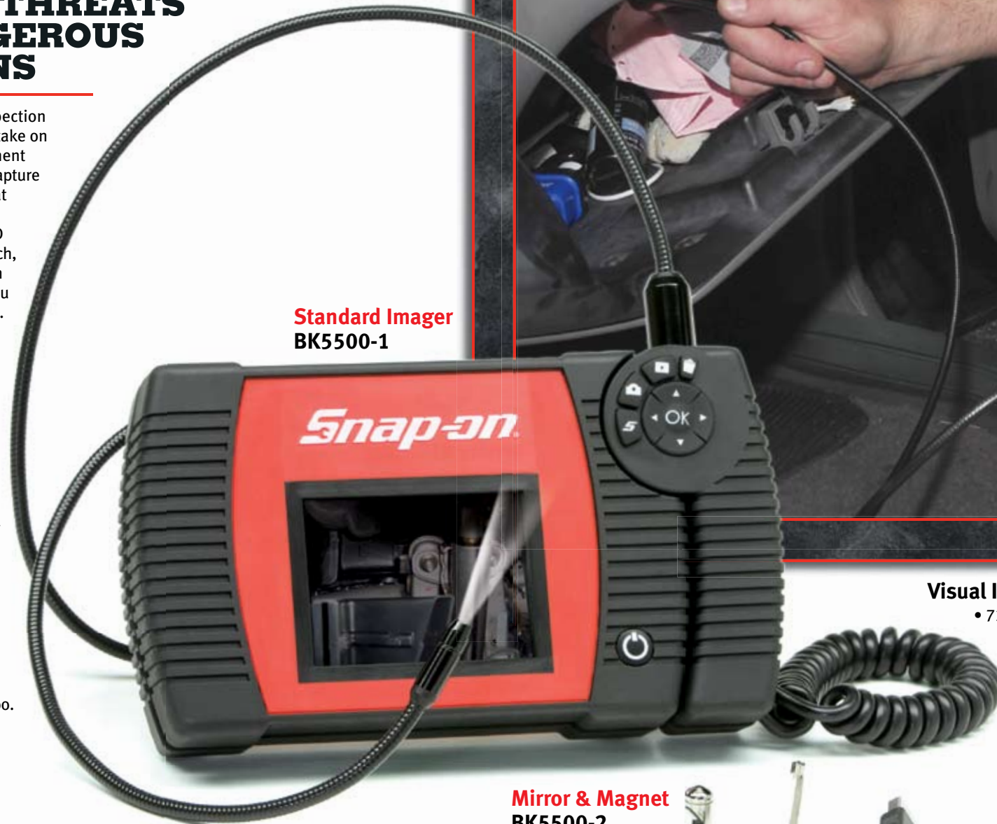
Standard Imager BK5500-1

It's all about being safe, reducing property damage, working faster, and smarter.