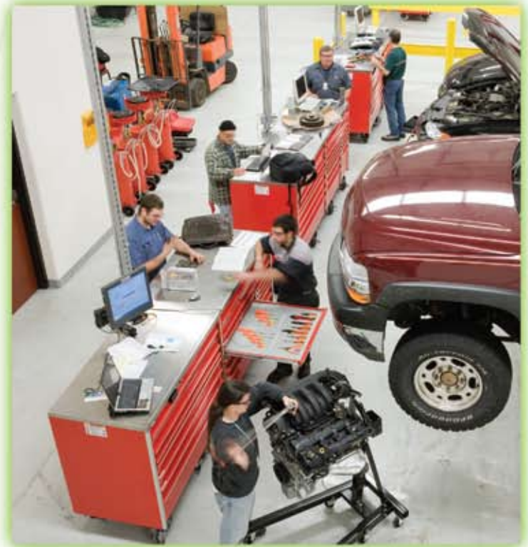
Who has it? What did they do with it? When did they take it? What job do we invoice for it? TC Max has all the answers – and now, so do you. TC Max asset management software gives you the total picture at all times, whether your operation is large or small.

A well-organized sign-out system. We think it starts with a well-organized page. And ours is as simple and intuitive as it gets. One screen covers both issue and turn-in. And with our unique audio prompt/command system, we even tell you what's going on.