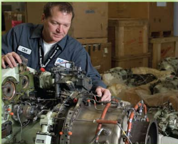
Asset control isn't just about saving time and saving money. Eliminating FOD (foreign object damage) can literally save lives. TCMAX can also coordinate with your invoice process by tracking parts and supplies that are to be billed to a certain project.

TCMAX works in all sorts of applications, across all sorts of industries. The software can also be adapted to your specific needs. TCMAX is also built to grow with your growing business. One client, an electrical contractor, had this to say about TCMAX, “TCMAX is an important asset for keeping track of our tool inventory. With 85 electricians taking tools to job sites every day, it would be impossible to maintain any type of control without it.”