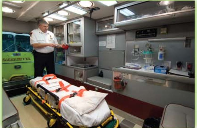
When seconds count, it's critical to know your inventory is intact. The TC Max system makes sure nothing is overlooked and nothing is taken for granted. TCMAX can also eliminate surprises by alerting you that disposables need to be re-ordered.

Simple, fast and accurate. Just enter the information – employee and location number and the number of the trailer/truck/building being inventoried. Then quickly start scanning barcodes. Keep going as long as you keep hearing “turn in.” You’ll hear “enter quantity” for multiples and “issue” when something is out of place. We’ve had customers tell us this feature cuts inventory time from a week to less than a day!