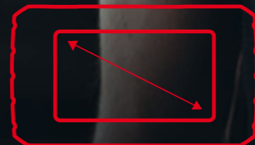
Angled 8" Screen