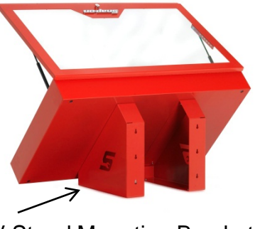
V-Stand Mounting Brackets