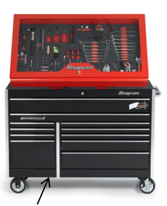
KRA2422PC Roll Cab