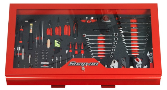
VCC 5S Box with V-Stand mounting brackets, and Foam Tool Control see page 4/5 for part #'s and details